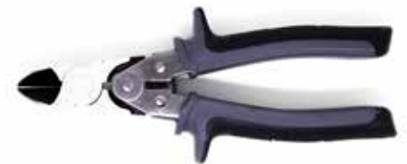
JCS 6.7" DIAGONAL COMPOUND ACTION CUTTER TL-CC-6.7D