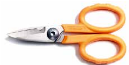
JCS KEVLAR SHEARS TL-KEVSHEAR

NOTE: If there is a particular product not listed that you require, please don't hesitate to contact the JCS Technologies Sales and Support Team today