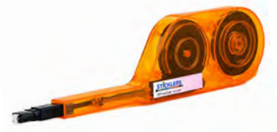
CLEANCLICKER® MPO MPO/MTP APC AND FLAT MULTIFIBRE CONNECTOR CLEANER, 600+ CLEANS CL-MCC-CCMPO

NOTE: If there is a particular product not listed that you require, please don't hesitate to contact the JCS Technologies Sales and Support Team today