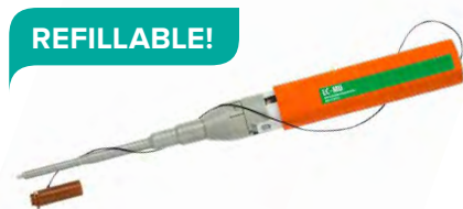
CLEANCLICKER® 125 SC/ST/FC 2.5 MM (BLUE) CL-MCC-CCU125 REFILL CL-MCC-CCU125