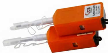
JCS 2.5MM MINI SC/ST/FC FIBRE CLICK CLEANER CL-MINI250CLEAN